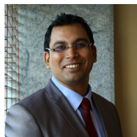
Data & Analytics Engagement Manager