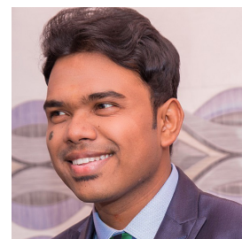
Associate Director - Data Science