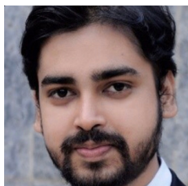
Lead Data Scientist