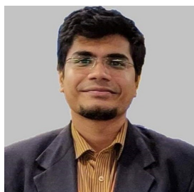
Data Science Consultant