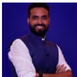
Sr. Product Manager