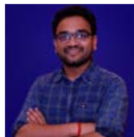
Sr. Program Manager