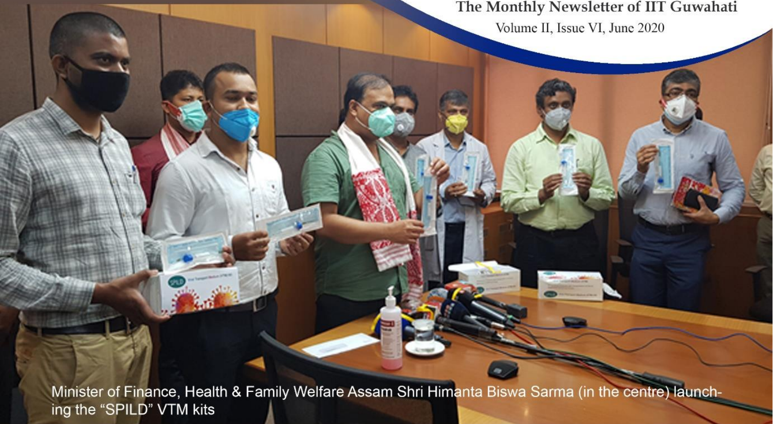
Minister of Finance, Health & Family Welfare Assam Shri Himanta Biswa Sarma (in the centre) launching the "SPILD" VTM kits

The Monthly Newsletter of IIT Guwahati Volume II, Issue VI, June 2020