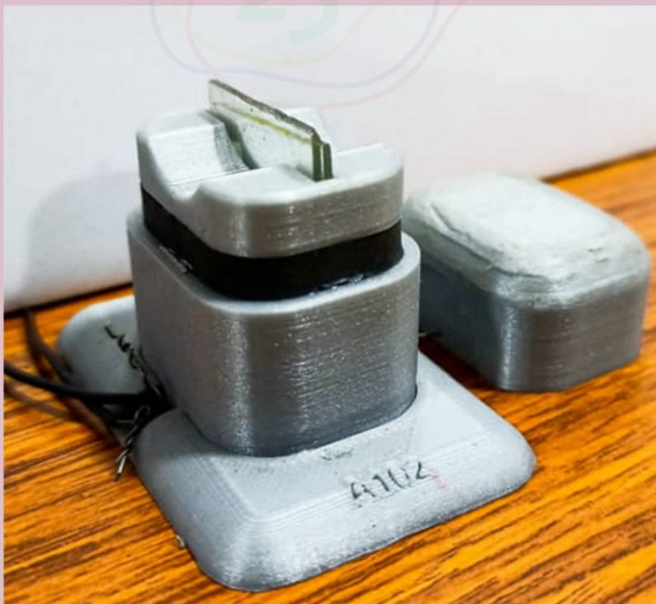
Point-of-care device for early & easy detection of diabetic retinopathy developed by IIT Guwahati researchers